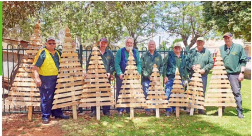
• Ouyen District Men's Shed members with their Christmas trees.

Keep your eye out for a lovely grove of Christmas Trees made for the community by those beaut blokes at the Ouyen District Men's Shed. Made from recycled shipping pallets and strung with lights, they really are delightful.