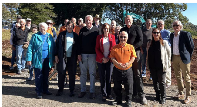
Supporters welcome the start of work on the Oxley Vale Lifelong Learning Centre site.

"That is what these sorts of facilities do."