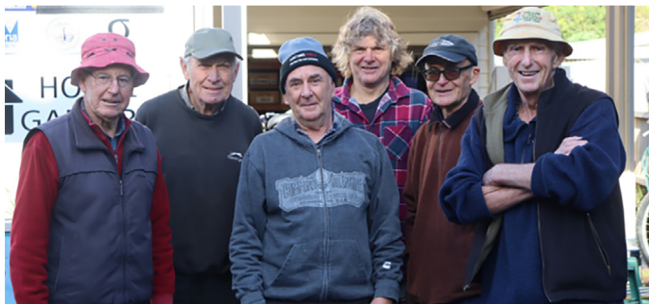
The 'bikies' have been running their service for over six years.