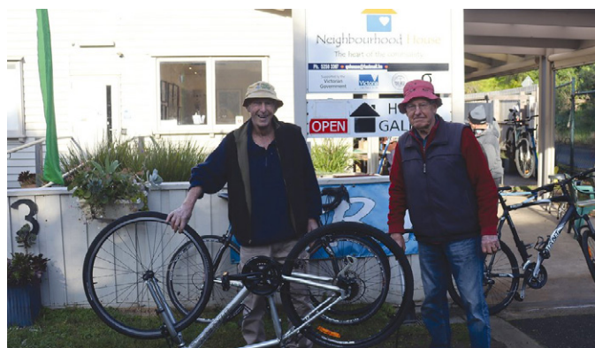
Over 400 bikes have been repaired so far during the bicycle group program.

If you'd like to drop off a bike to assist the program, bikes must be in a reasonable condition to be able to be repaired, with minimal rust and dings.